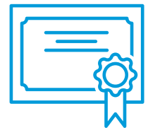
Certificates & Reporting